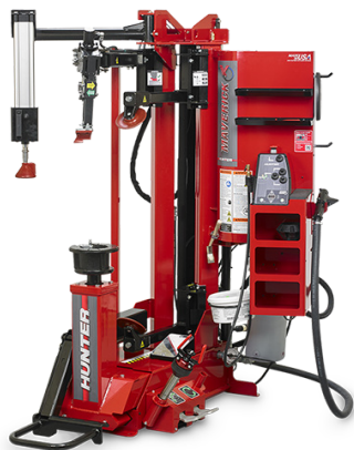
Maverick w/ Optional Wheel Lift